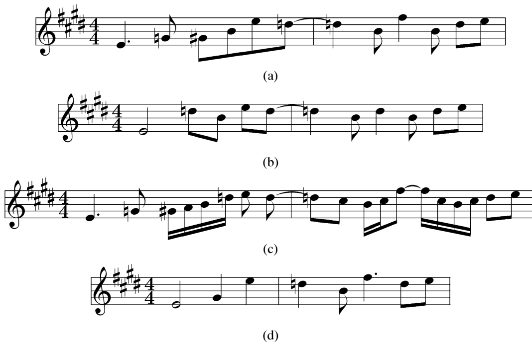
Figure 2: (a) Piece of Day Tripper (The Beatles) (b) Variation with conservation of the tonic and the dominant of the E Major tonality, respectively E and B (c) Variation with insertion of passing notes between the notes of the melody (d) Variation with conservation of the notes placed on the beats.

therefore to mark all the notes whose pitch interval with its neighbours is less or equals to two semi-tones, and whose the pitch variations with these neighbours are opposed, like with a positive variation with the precedent note and negative one with the following note. The edit scores are computed according to the information about the passing notes by changing the insertion/deletion score associated to marked notes. This edit score is less important than the usual substitution/insertion score. Thus, the insertion or the deletion of notes is less penalized by the similarity system.