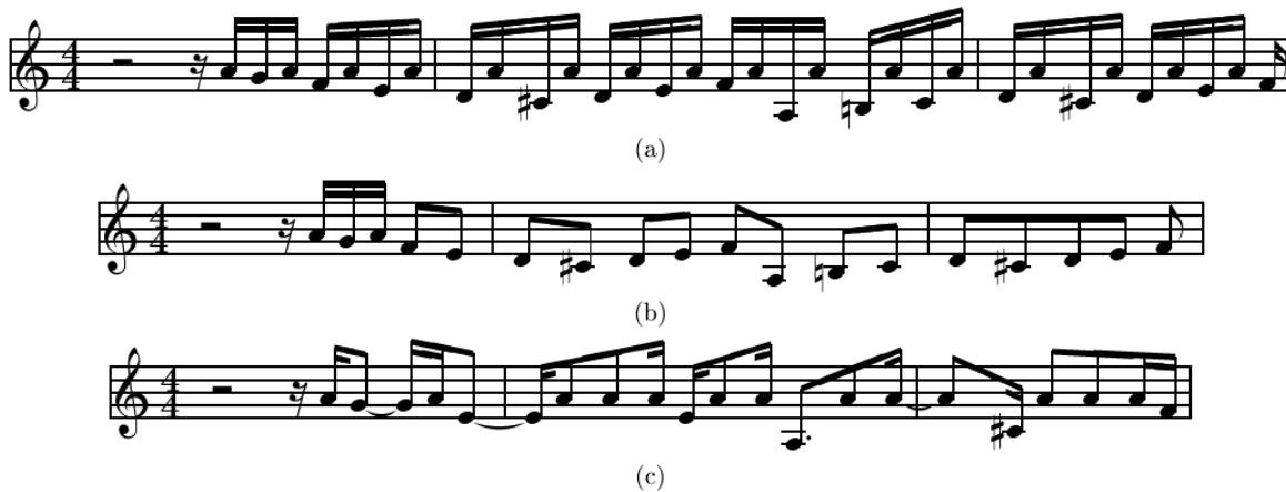
Figure 3: (a) Piece of the Toccata and Fugue in D minor (Bach) (b) Here is a variation where a lot of notes have been removed, except the notes which are on the beats. (c) On the opposite, this variation is built by removing several notes that were on the beats. The number of the notes is nearly the same in (b) and (c) but the results are perceptually very different: only the variation (b) sounds similar to the original version.